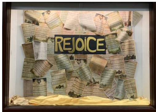
Display cases ~ Christel Kasprzak