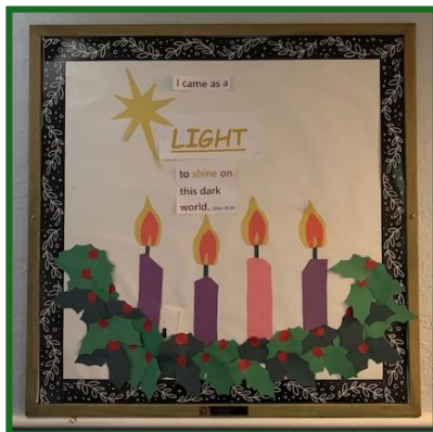
Church narthex bulletin board