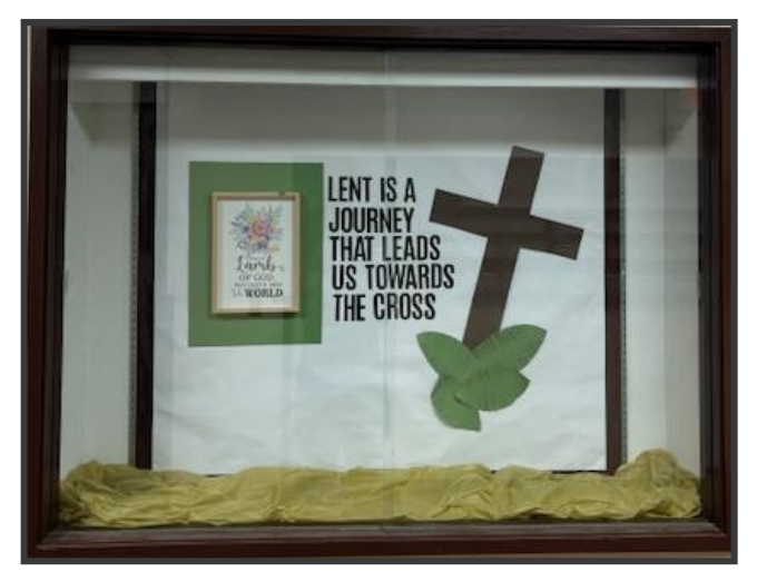
Display case by Christel Kasprzak