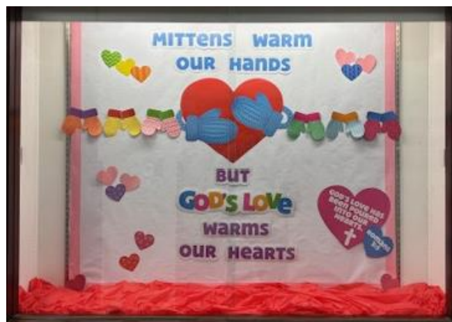
Display case by Christel Kasprzak